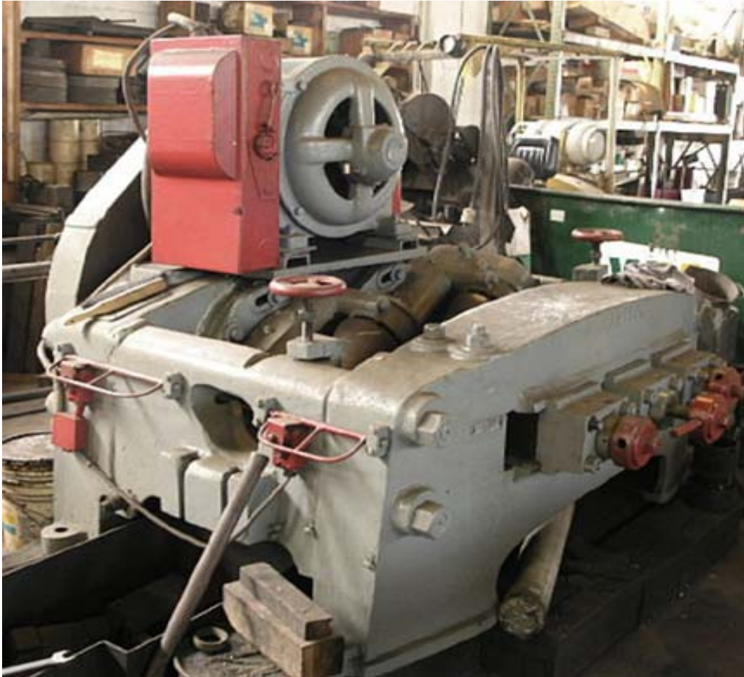
Bar Straightener for Sale

PO BOX 307, 897 ROUTE 910, INDIANOLA, PA 15051 USA PHONE: 412.767.9290 FAX: 412.767.9272 www.steelequip.com e-mail: steelequip@pgh.net