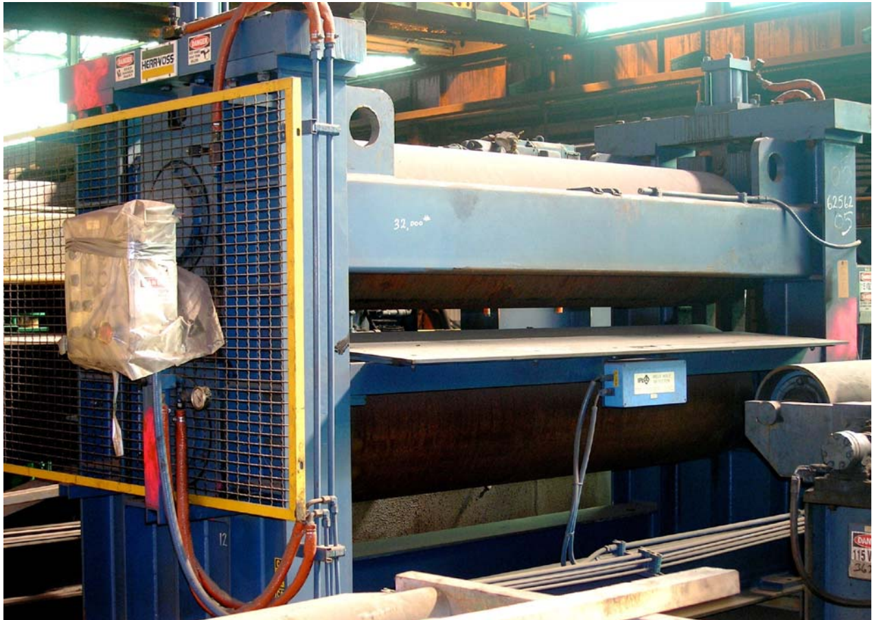
2 High Expanded Metal and Embossing Flattening Stand